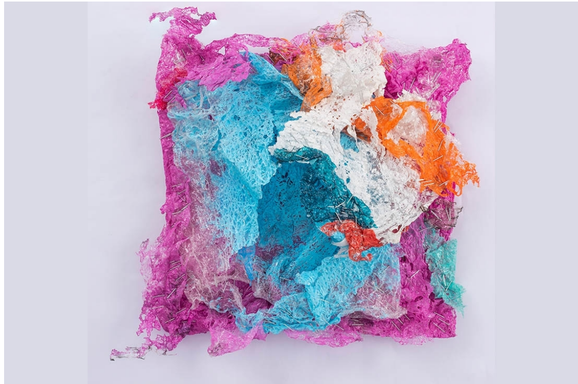
Untitled (6) , 2018

by Aaditi Joshi, Fused Plastic bags, Acrylic Colour 9.5 x 10 x 2.5 inches