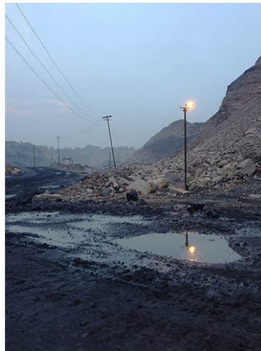
Jharia End of Time 5 (A) , 2014 by Ronny Sen, Archival Pigment Print 9 x 6.75 inches Edition 1/8

Tap www.tarq.in ( http://www.tarq.in ) for the online show.