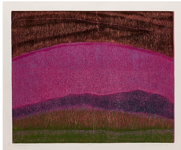
Skin VIII , 2018

While the virus is consuming our screens and social media, we wanted to focus on the state of the world with humans temporarily taken out of the equation. It is interesting to see nature feeling free to finally breathe again, from more birds chirping to spotting dolphins, to cleaner air. At the same time, we are aware of the grave consequences the global shut down will have on the economy at large, and especially on already disadvantaged communities all around the world. In Resurgence , the works look at ideas of environmental degradation, healing in both urban and rural spaces, while acknowledging the stillness and uncertainty that surrounds us.