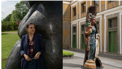
For Kher, the real luxury now is attention. Bharti Kher

Bharti Kher is not interested in the obvious markers of luxury: price, rarity, visibility. What endures, she suggests, is far less visible. "The real luxury now is attention," she says. She means both the artist's, while making a work, and the viewer's, while experiencing it. That emphasis on time, depth, and attention runs through Kher's decades-long practice, with her work drawing from everyday objects and cultural symbols, translating them into forms that feel familiar yet disorienting. The bindi, perhaps her most recognisable motif, becomes, in her hands, something far more complex—an object that holds within it layers of identity, ritual, politics, and memory. Multiplied and displaced, it moves away from the body and into a new form of expression that is deeply personal and culturally charged.