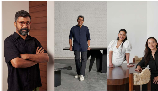
A curated list of India's masters of luxury art highlights how true luxury lies in time, depth, and authenticity. From Left to Right

From durational performances and surrealist drawings to collectible design and craft, India's luxury art vanguards place time, emotion and integrity above spectacle and market trends.