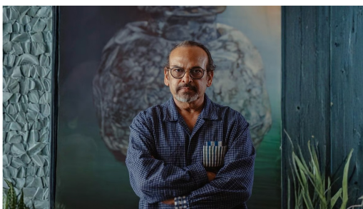
Subodh Gupta's work begins with objects most people would overlook. Subodh Gupta

Subodh Gupta's work begins with objects most people would overlook. A steel tiffin, a thali, a milk pail, bartans and pieces found in almost every Indian home. In his hands, these everyday items are brought together, repeated, and transformed into large, striking sculptures. What the artist captures through them is a changing India—its aspirations, its movement, and the tensions between tradition and modern life.