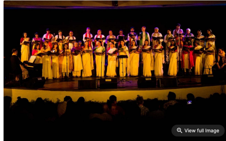
The Capital City Minstrels are set to perform their summer concert, 'A Symphony of Love'