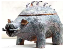
An animal figurine that's part of the 'Earth Offerings' exhibition