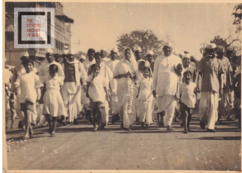
Scenes from the Quit India Movement.