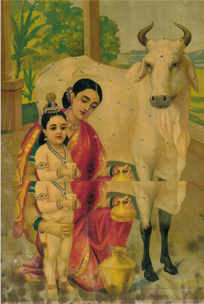
Raja Ravi Varma Heritage Foundation