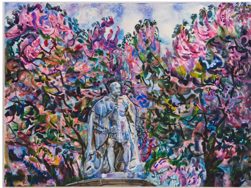
King Edward VII Statue, Cubbon Park, Bangalore. By Rumale Chennabasaviah (1976).

He was a freedom fighter, a nation builder, a politician, an editor, a spiritual seeker and a cultural and social activist. And because this was not enough, he became a self-taught painter at the age of 52. Rumale Chennabasaviah, whose intricate canvases earned him the title of 'Karnataka's Van Gogh', created almost 600 paintings through his lifetime. This retrospective, which commemorates Salar Jung Museum's 75th year, also celebrates the great artist by featuring 80 major works as well as archival photographs, personal memorabilia, sketches and audio-visual material that delves into his long and illustrious life. Translating to 'harmony of colours', Varna Mythri gives us a glimpse of Chennabasaviah both as an artist and a man of integrity in everything he did and every brushstroke he made.