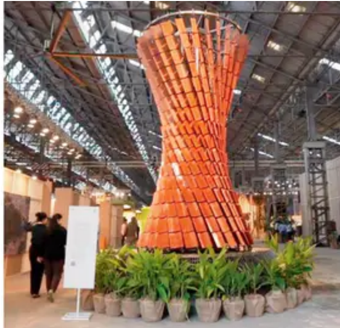
Visitors observe CoolAnt, a biophilic air cooling solution installation at the 2024 edition.

Spread over three days, the 2025 edition of the Godrej Conscious Collective sets its sights on the hottest topic across the world, staying cool