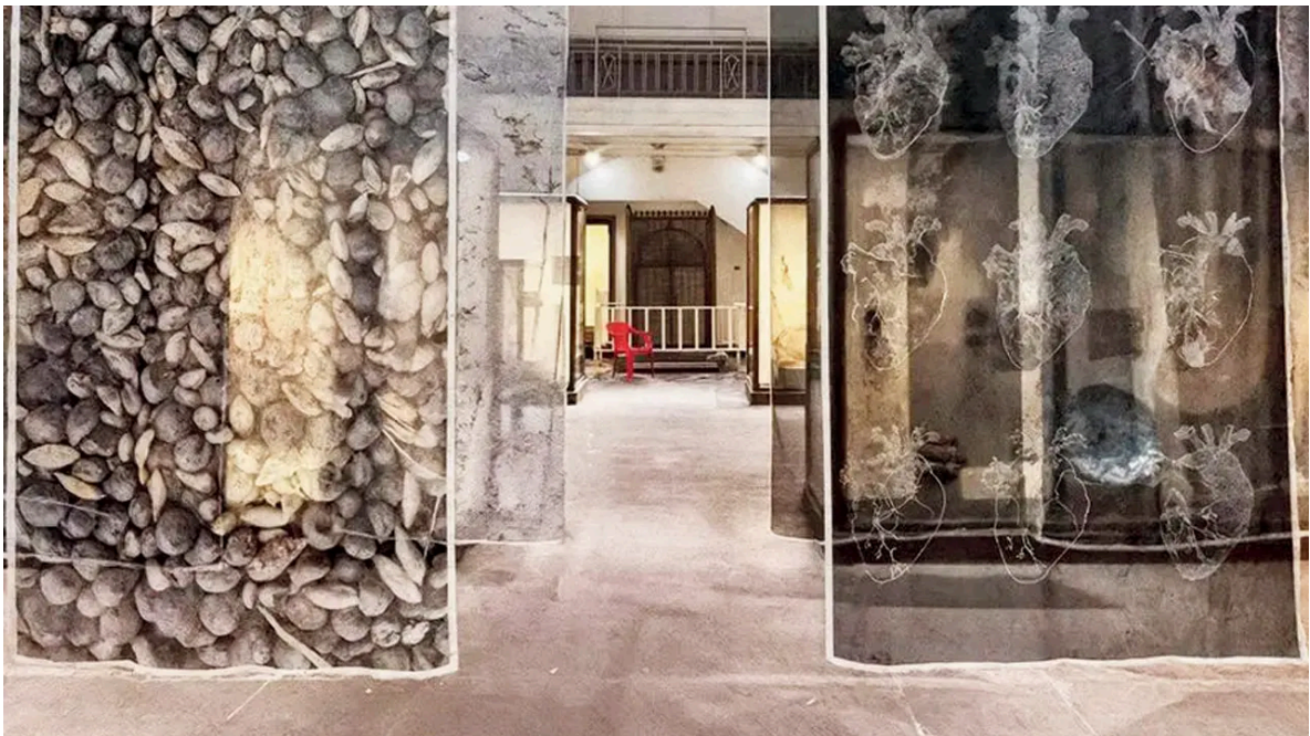
A view of the artwork Memories From The Land