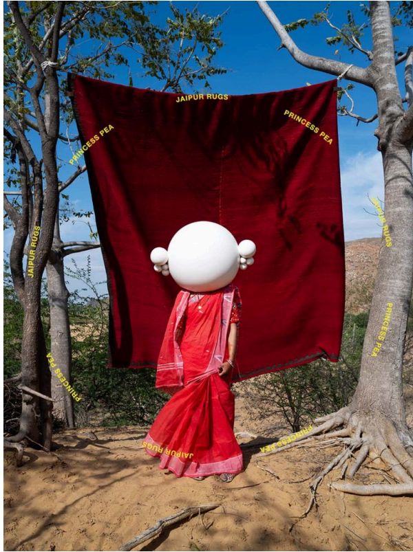
The rugs evolve from Princess Pea's miniature silk paintings

Developed over months inside real homes and lived environments, 'DAYS' reflects the cyclical nature of a woman's life — her ability to withstand, to nurture, to pause, and to begin again. Each rug becomes a moment within this journey, expressed through colour and rhythm with carpets in the collection titled 'Day 1 – Blue' signifying depth, and contemplation. Day 2 – Pink sands for softness, and vulnerability. 'Day 3 – Mustard' is rooted in the persistence, and grit of a woman. 'Day 4 – Salmon' is symbolic of the warmth, and the spirit of renewal that a woman embodies.