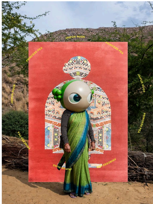
Princess Pea x Jaipur Rugs

“The act of wearing the head became a quiet yet powerful declaration of identity, visibility, and belonging. Here, the head – once a symbol of anonymity – stands against the landscape like an emblem of strength. It conceals, yet reveals; it softens, yet asserts. Each image, like each knot, becomes a testament to resilience – a reminder that art and craft, body and self, can together weave new meanings of freedom and dignity,” shares Jaipur Rugs in its collaboration post with multi-disciplinary artist Princess Pea.