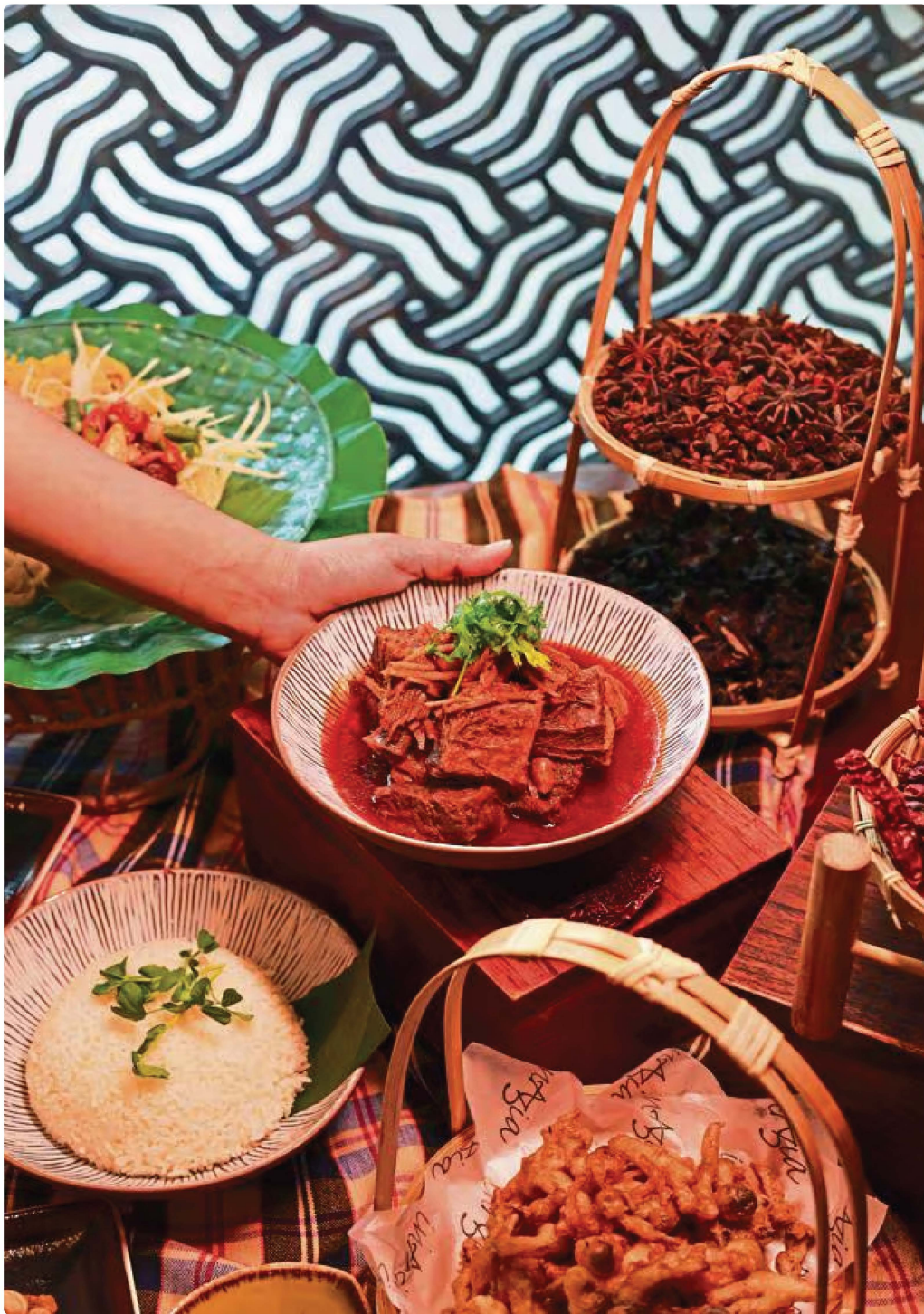
On the menu are Thai delicacies for Loy Krathong