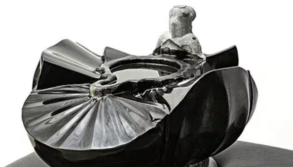
A sculpture on display at the 'Sculpting with Light & Darkness' group show.