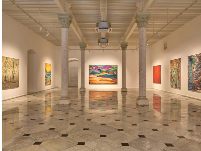
The neo-classical interiors of Galerie ISA feature the exhibition titled 'As Far As The Eye Can See' by multifarious artists.