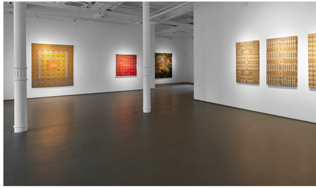
The pristine palette of Akara Modern and Contemporary features The Quiet Interlude by Trishla Jain.

Located in the heart of Mumbai's art district, Akara was founded in 2009 by Puneet and Megha Shah with a vision to ally modern Indian art and contemporary global dialogues. Since then, it has flourished into an arduous presence with two distinct spaces that sit together harmoniously. Akara Modern , established in 2015, champions India's renowned modernists. Just steps away, Akara Contemporary—housed in a grand Indo-Saracenic building—features emerging and mid-career artists from South Asia and beyond. The gallery's curatorial vision is led by a cohort of young women curators—Veeranganakumari Solanki, Arushi Vats, and Shreemoyee Moitra—repositioning South Asian art within a global framework.