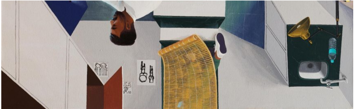
58, 2019. Acrylic on canvas 72 x 36 inches

'You Are All Caught Up' opens today and will run till January 7, 2021 at TARQ, Mumbai