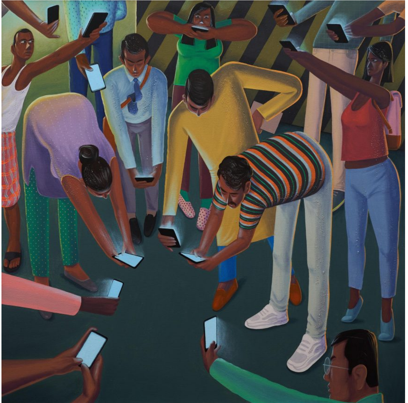
I LIKE IT. WHAT IS IT?, 2019 Acrylic on Canvas. 48 x 48 inches