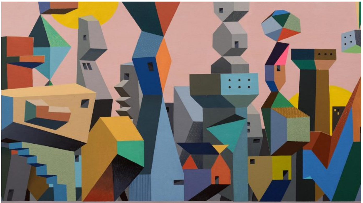
THE MIGRANTS HAVE LEFT, 2020 Acrylic on canvas. 36 x 72 inches