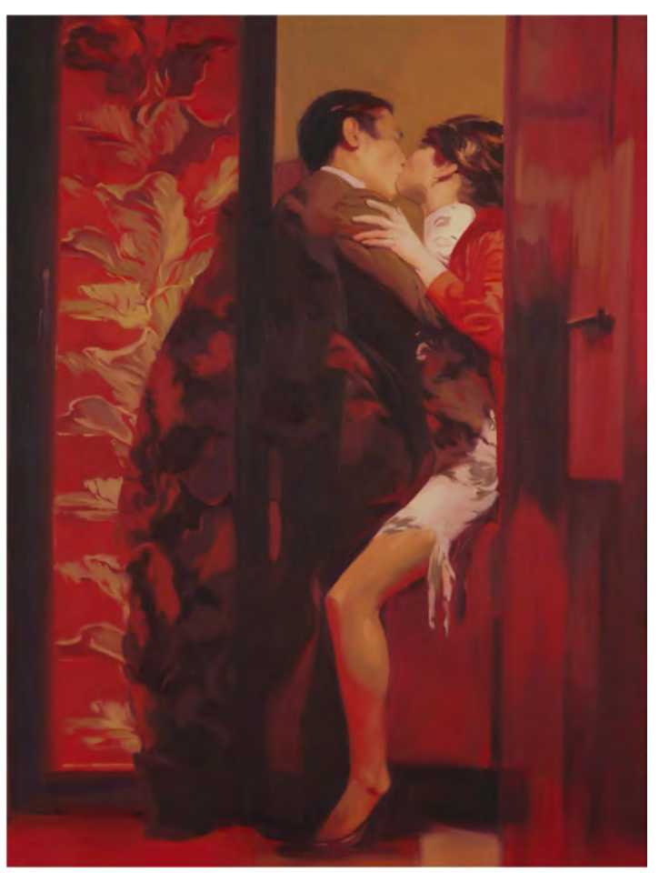
The Weight of Love by Varad Bang

FASHION BEAUTY CULTURE SHOPPING HOROSCOPE WEDDINGS BEAUTY & WELLNESS HONOURS THE WEDDING ATELIER MET GALA