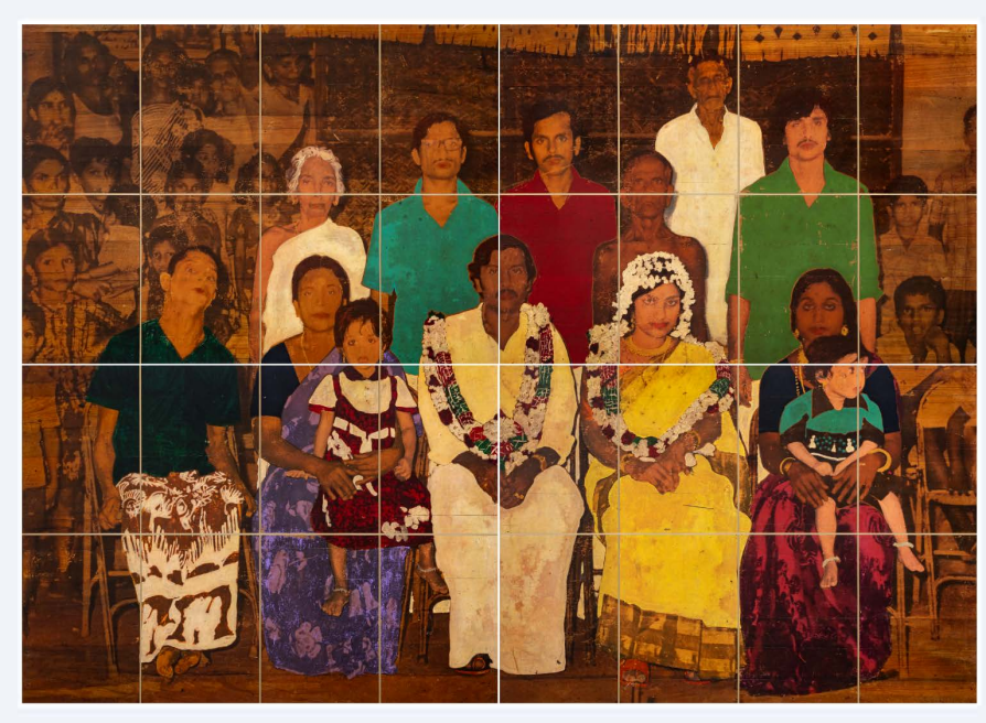
11th May 1980 Wedding Day #2, 2024, Image transfer, acrylic colour, brass inlay and varnish on recycled teak wood, 84 x 60 inches, Set of 4 panels

The paint is applied to a digital print of the photograph, and subsequently transferred onto wood panels. This results in a complex, reverse layered image which is arranged consecutively across the walls of the booth, making it a host of painted memories brought to life. The revisitation of collective memories and myths are presented with care and dexterity for the viewers to pay attention to family histories that survive in splintered recollections and images.