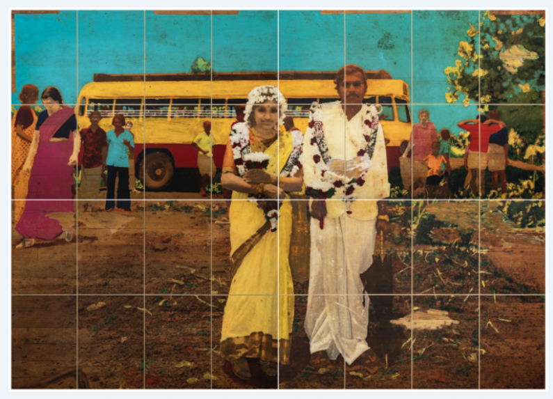
11th May 1980 Wedding Day #1, 2024, Image transfer, acrylic color, brass inlay and varnish on recycled teak wood, 84 x 60 inches, Set of 4 panels

In the catalogue essay of 'Home Ground', Kunhan's solo presentation at TARQ in 2022, writer Skye Arundhati Thomas supports his reflections, "A family history is always representative of something much larger than itself: the social, political and cultural shifts experienced by the geography in which it is set engineers its sudden detours. Kunhan follows its routes; he is less interested in evidence that is materially traceable, and more in what lingers more ephemerally, more abstractly – in the senses, and in the small remembrances of the mind."