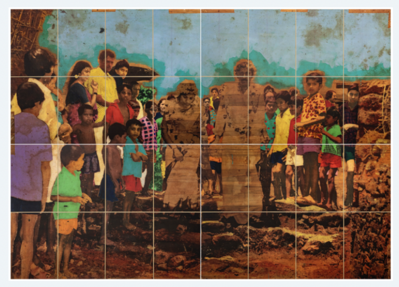
11th May 1980 Wedding Day #4, 2024, Image transfer, acrylic color, brass inlay and varnish on recycled teak wood, 84 x 60 inches, Set of 4 panels

In this series, Kunhan's move towards drawing from familial archives also marks his departure from his use of museum archives. The fragmented nature of family histories and experiences are connected thinly by the faculty of memory that is understood as the pillars of a structure that supports wider oral histories. Kunhan believes that an individual's artistic response ought to stem from their emotions rather than their intellect.