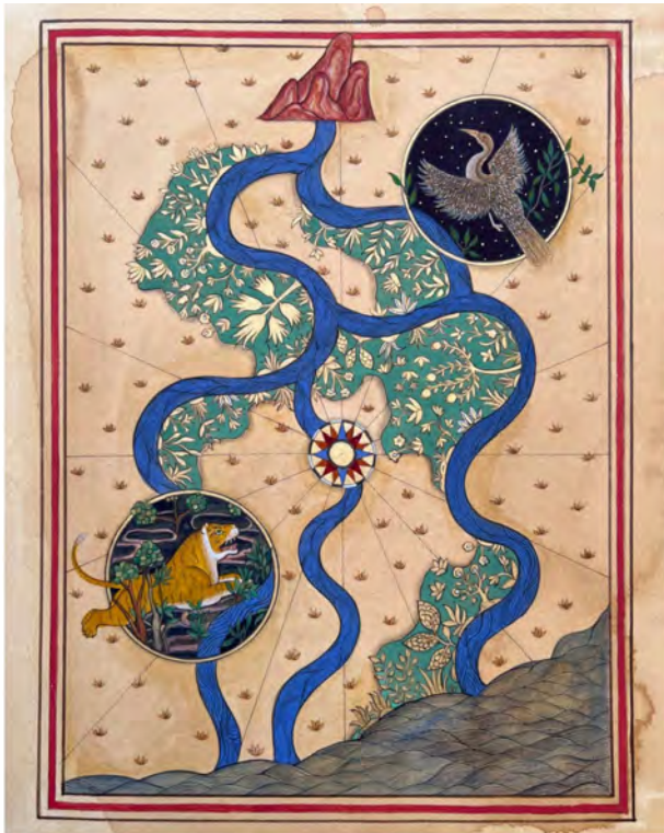
Ayesha Anjad, Ethereal Journeys 1 , 8.3 x 11.7 in, Water colours with hand-made pigments on Card stock.