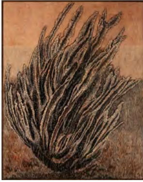
Soghra Khurasani, Grounded (to remain) , 1, 2024, Woodblock, 49 x 39 inches.