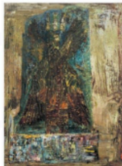
Naval Jijina, Cyrus The Great , 1968