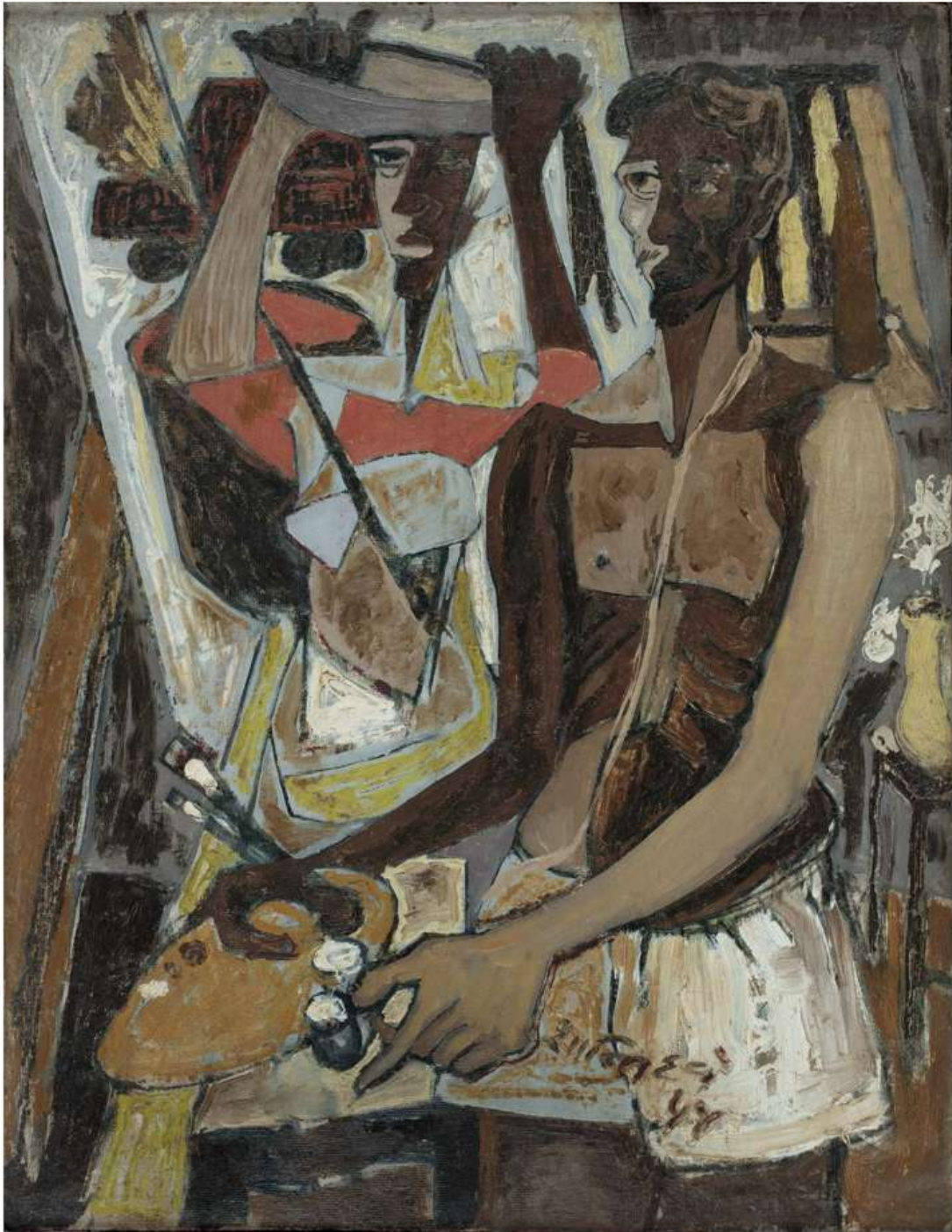
Untitled (Self-Portrait), 1954