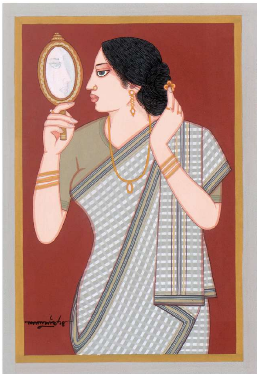
Lalu Prasad Shaw, Reflection , Tempera on Paper