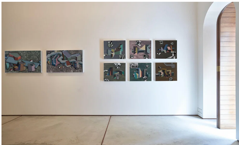
A still from the exhibition 'Edifice Complex' Sameer Kulavoor

The exhibition unveils a comprehensive body of work across six series. Drawn Timelapses captures the essence of condensed time through a series of sequential drawings presented alongside a video, showcasing the perpetual state of flux experienced by these architectural structures. By zooming in, Kulavoor provides an intimate exploration of the intricate components that form these complex urban landscapes, emphasizing their temporal progression. Each drawing on a single page is intricately linked to its predecessor, resulting in a dynamic visual narrative.