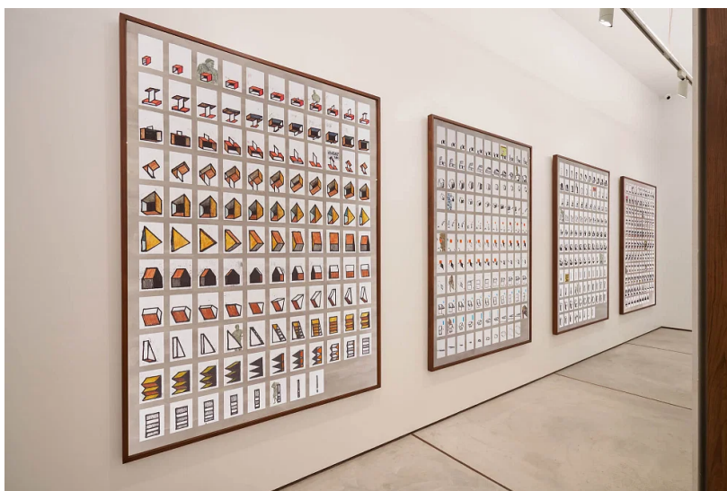
A still from the exhibition 'Edifice Complex' Sameer Kulavoor

The exhibition unveils a comprehensive body of work across six series. Drawn Timelapses captures the essence of condensed time through a series of sequential drawings presented alongside a video, showcasing the perpetual state of flux experienced by these architectural structures. By zooming in, Kulavoor provides an intimate exploration of the intricate components that form these complex urban landscapes, emphasizing their temporal progression. Each drawing on a single page is intricately linked to its predecessor, resulting in a dynamic visual narrative.