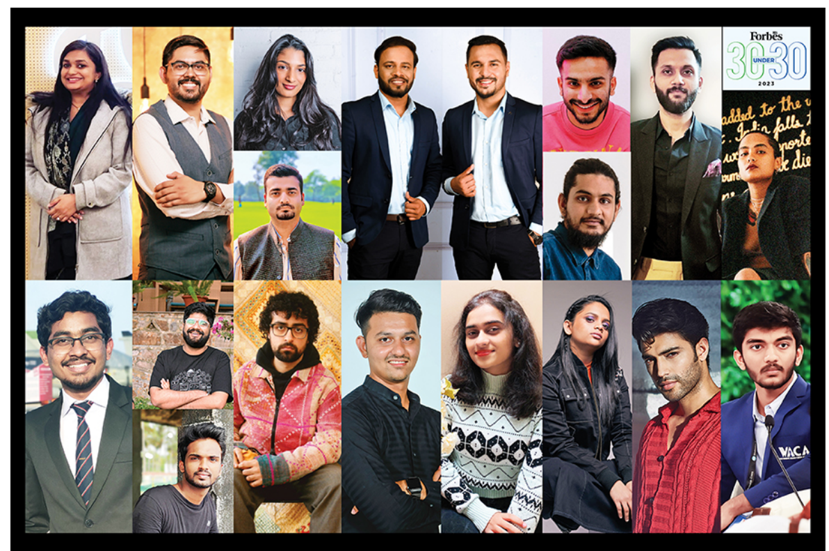
Apart from the 30 listees, we find people we couldn't ignore in nearly every category even if they didn't make the cut for the final list—these are 2023's people to watch out for