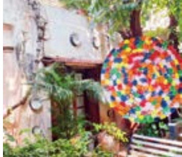
A glimpse at the previous edition at Khotachiwadi