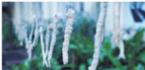
The installation art used gauze to mummify bombil.

due to excessive fishing and climatic changes, it has moved to other breeding grounds. This means loss of livelihood for the Kolis. We wanted city people to know what this