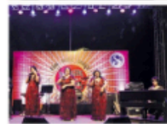
(Above) Members of The Sassy Songbirds: a moment from their performance in 2020