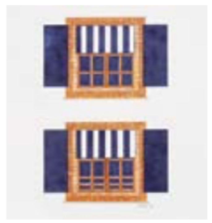
Basel Project One (detail 1), 2022, PIC COURTESY/ VISHWA SHROFF AND TARQ