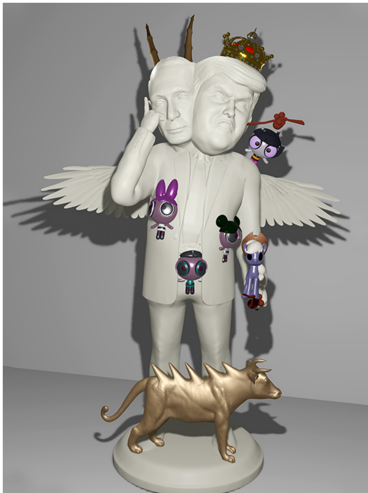
'Spy vs Spy' by Raghava KK (2022), Photo courtesy Volte Art Projects < https://www.designpataki.com/must-visit-galleries-at-alserkal-avenue-dubai/>