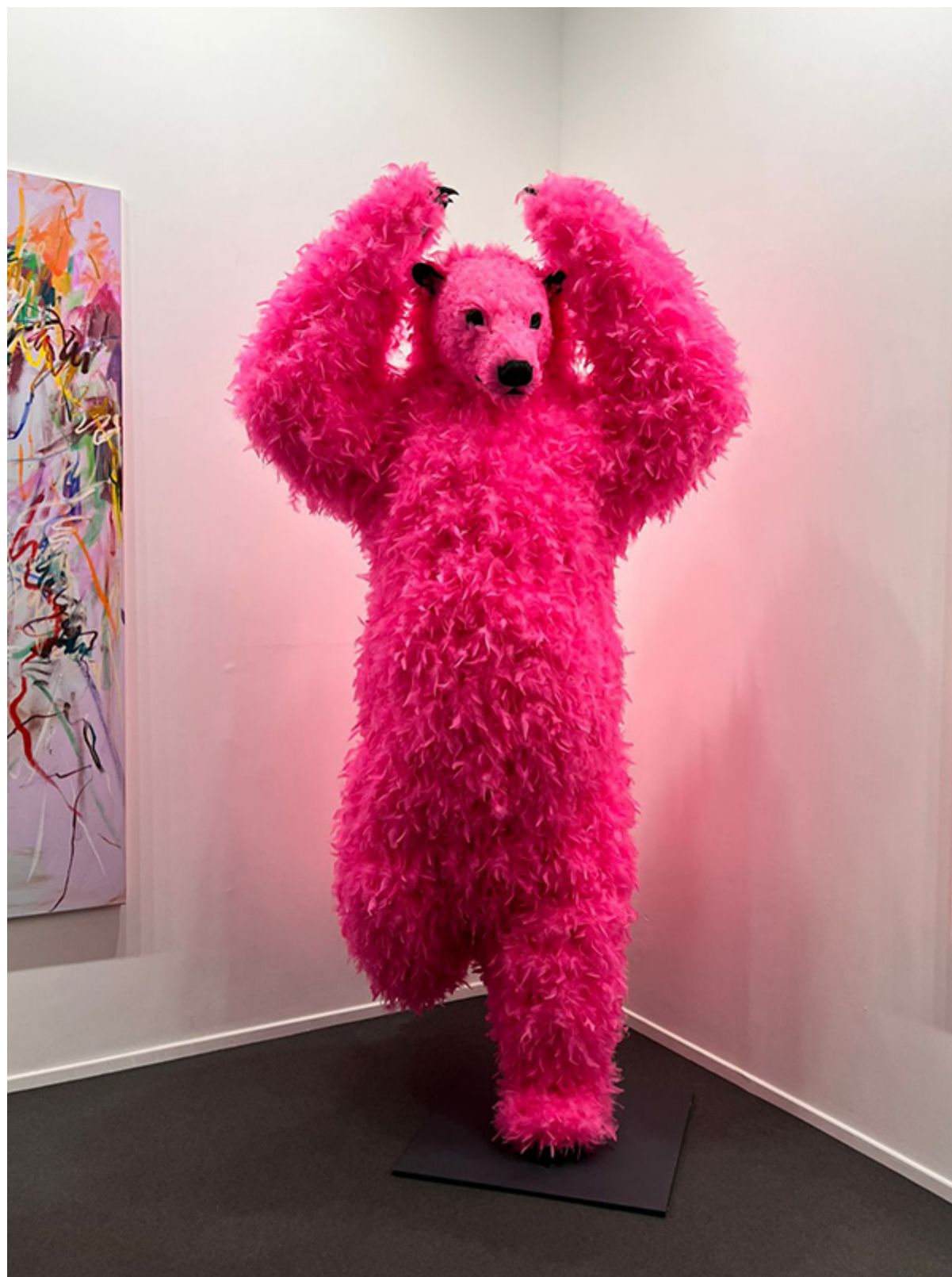
'Neon polar bears' by Paola Pivi at Perrotin Gallery.

Paola Pivi's Neon Bear at Perrotin Gallery < https://www.designpataki.com/daniel-arsham-on-his-latest-collaboration-with-ikea-democratizing-art-and-taking-inspiration-from-popular-culture/ >