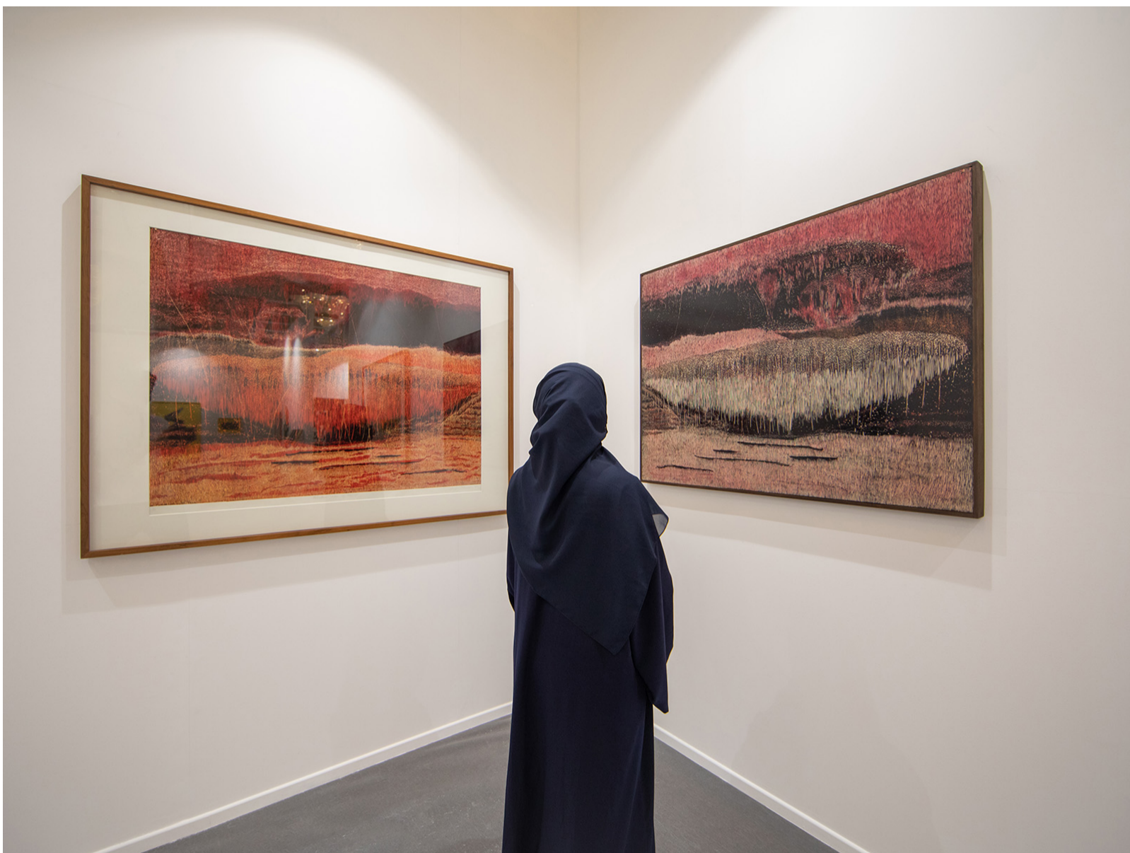
'Shadows Under My Sky,' (2022) print and woodblock by Soghra Khurasani at the TARQ booth