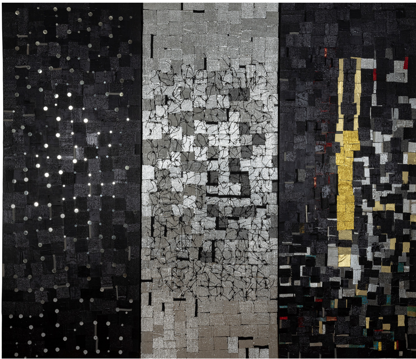
'Kaal' Triptych (2010) by Mona Rai.

Take for instance her three-panel work on canvas titled 'Kaal,' which deals with the subject of emotions and introspection. Using brocade fabrics, mirrors, metallic foils, strings, and screws, Rai takes viewers on a meditative adventure. This "painting" is also a reference to various textile traditions of India. Through each exploration, she uses the material to create a language within her works. Another work that stands out is one titled 'Stitched Cloth or a Thousand Stories,' made of mixed media on Fabriano paper. At first glance, it appears to be a collection of odds and ends on paper that resembles perhaps a circuit board or a game of 'dots and dashes' played with tactile materials. The work takes viewers in many directions and in this way Rai tells viewers a thousand stories in a language of her own.