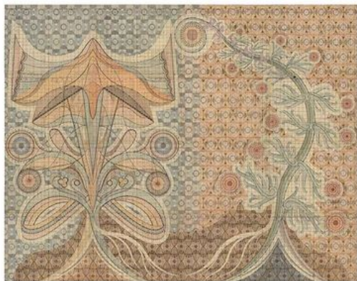
Aconite , 2021

Graphite and colored pencil on antique ledger book pages, 189 x 238 / 75 x 95 in