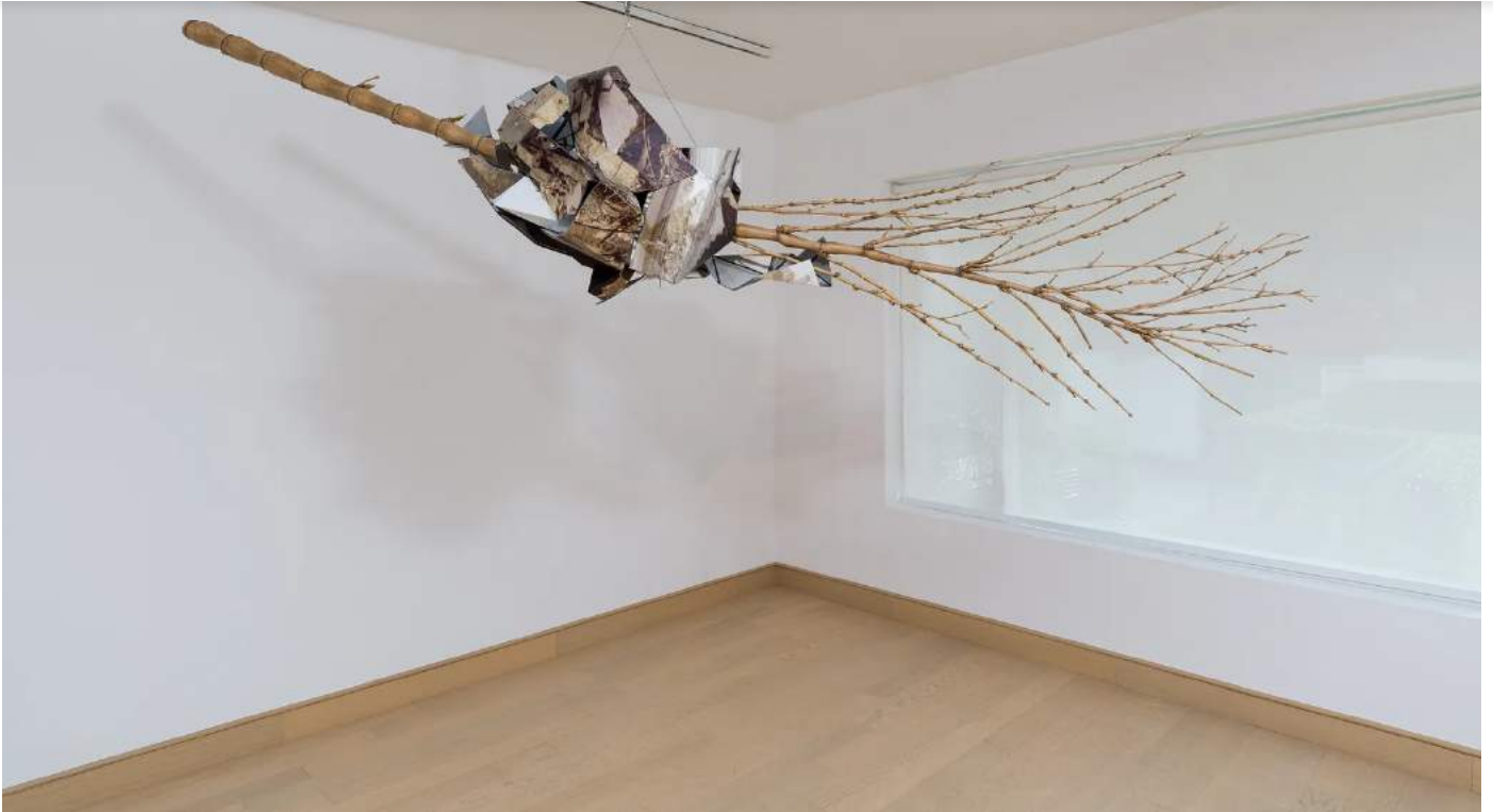
Asim Waqif's 'Municipal Demolition 4'

Asim Waqif's artwork emerges from the artist's deep connection with materiality. Waqif fuses materials together in unexpected ways, presenting both natural and industrial mediums as an incongruous, yet cohesive unit. Of note is a recent work created with cane craftsmen in Nagaland, which represents an evolution in his oeuvre. Also on display, are Waqif's unique photographs, developed using his own signature technique of manipulating paper and shadow.