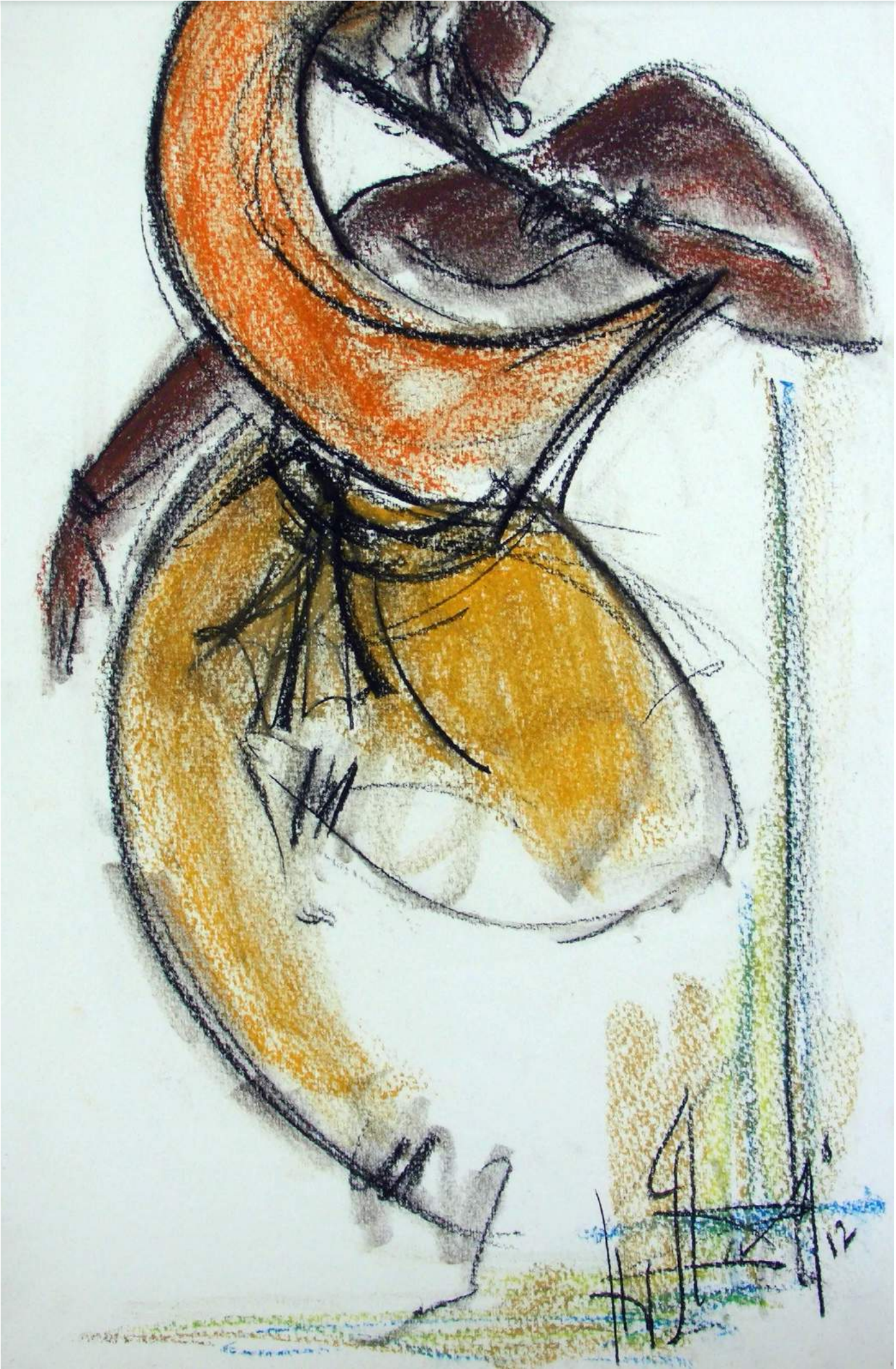
'Kavadi 2' by AV Ilango