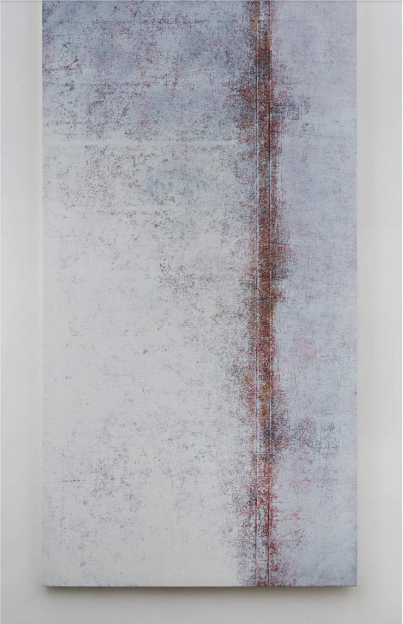
Untitled (2021) by Sheetal Gattani