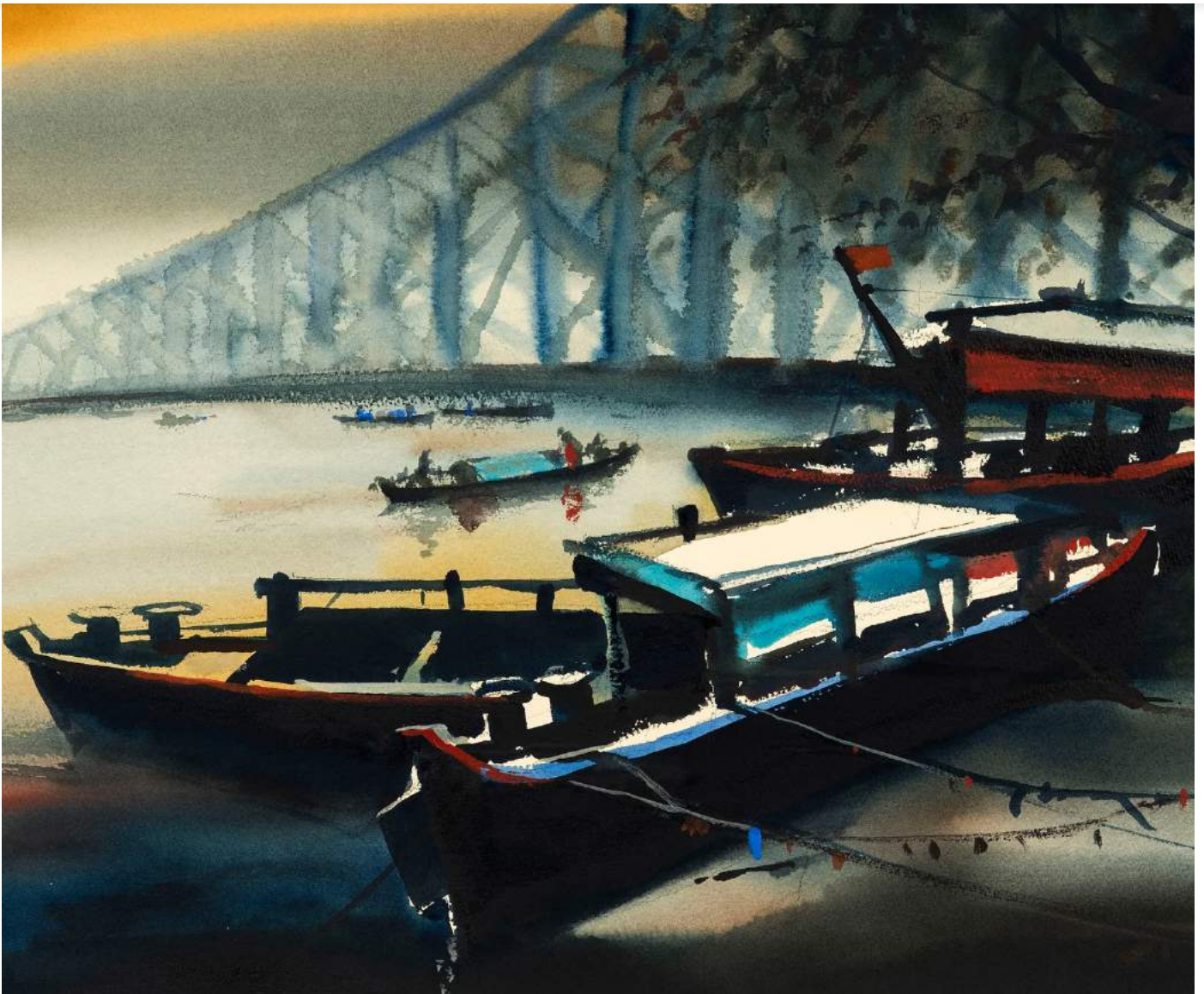
Paresh Maity's water colour on paper (1998)