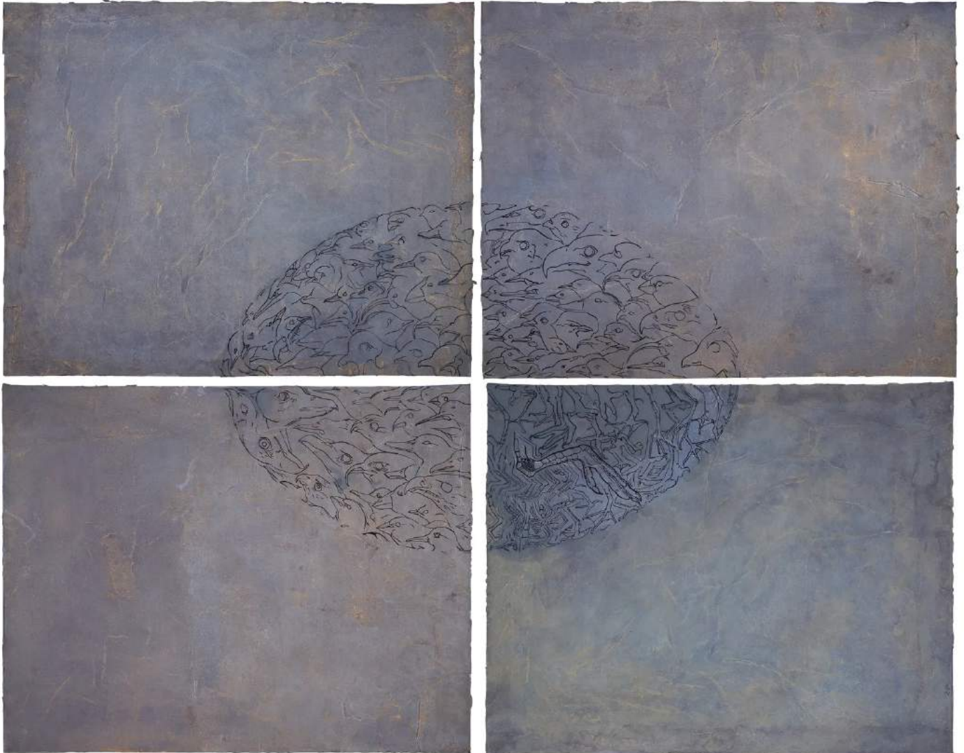
Tanmoy Samanta's 'The Birds in the Rain' (2020)

Tanmoy Samanta’s third solo showcase at TARQ is a reflection on the pandemic, and how it changed the way we see our domestic spaces. The Delhi-based artist’s collages and watercolours deftly weave ideas of solitude, reflection and memory, and consider how they exist within the fabric of our homes. Look out for the exhibition catalogue which features an essay by Ranjit Hoskote, who had curated Samanta’s first solo show in Mumbai in 2014.