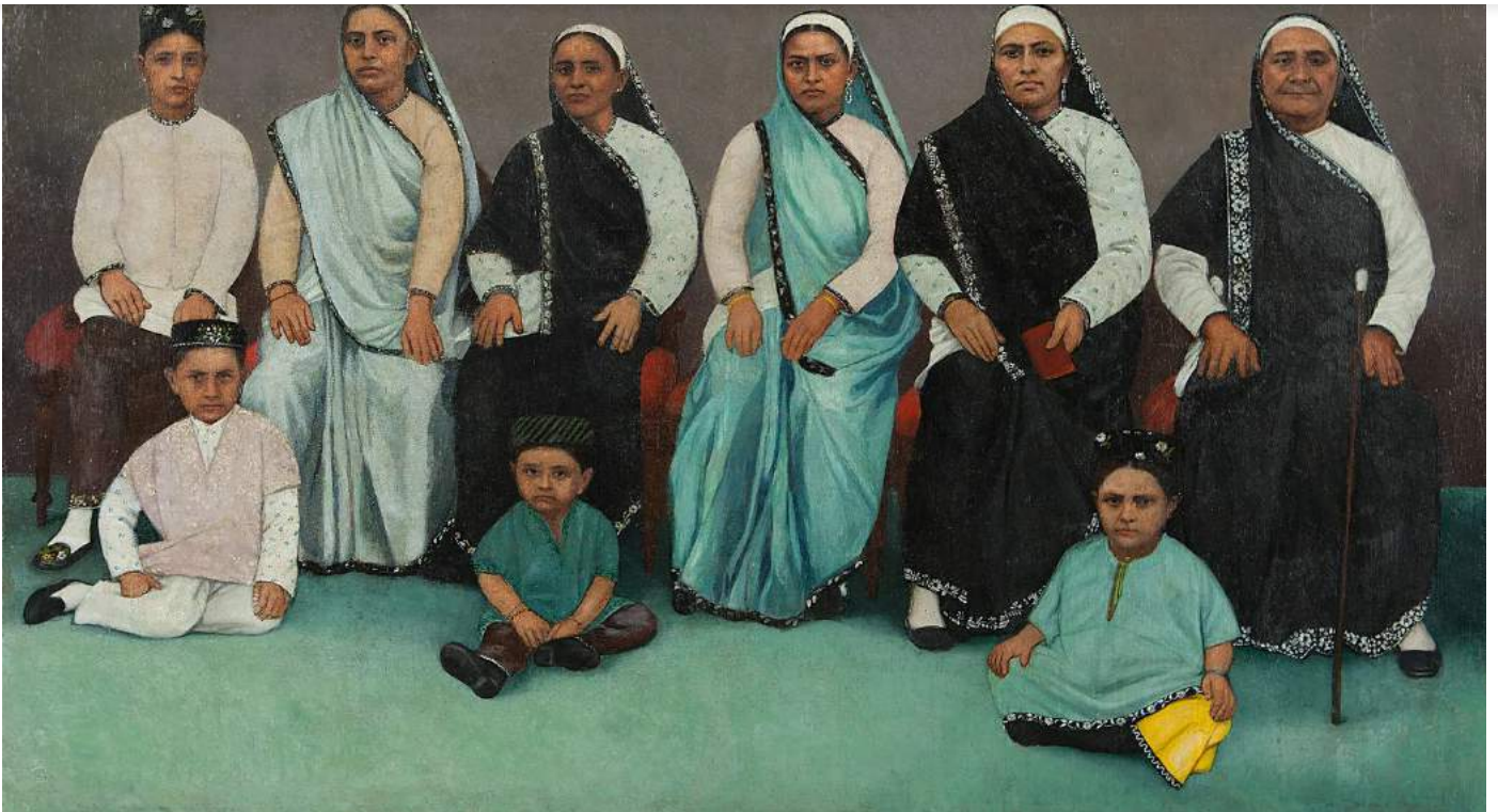
Untitled by Anonymous

DAG's ambitious group showcase is, at its core, a lesson in art history: it follows the journey of Indian art from the colonial era to post-Independence modernist abstraction, through a study of blue. The exhibition traces the various evocations of the colour, from its religious and cultural significance, to its impact on political history. Notable pieces include works by MF Husain, FN Souza, Sunayani Devi and Prabhakar Barwe, among many others.