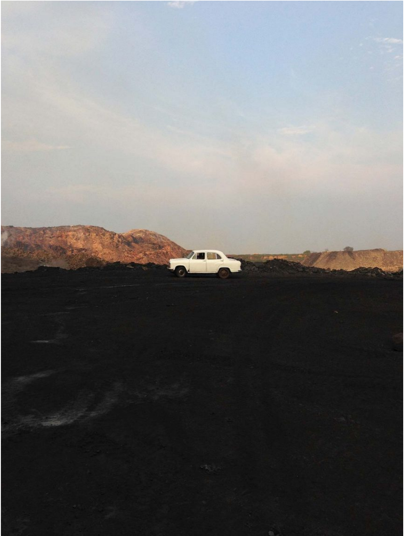
Ronny Sen, Jharia–The End, 2B, Digital Print on Archival Paper

While their mediums of choice vary, the artists' distinct bodies of work come together in their enquiry of the contemporary moment that simultaneously has cultural and regional specificities as well as global commonalities.