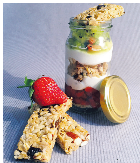
Granola bar and granola in a jar at Love and Cheesecake