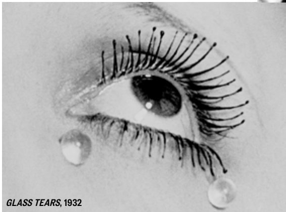
GLASS TEARS, 1932

Man Ray is among the leading names of the avant garde movement in 20th century Europe; and people often only have a vague notion of who he was. Ray's work was radical and had a tremendous impact on the language of film, fashion and advertising—fields that drive the creative impetus of Mumbai. It's quite fitting that the first exhibition of his work should take place in an art deco building.