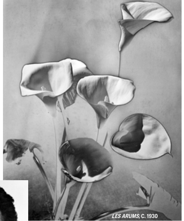
LES ARUMS, C. 1930

Man Ray is among the leading names of the avant garde movement in 20th century Europe; and people often only have a vague notion of who he was. Ray's work was radical and had a tremendous impact on the language of film, fashion and advertising—fields that drive the creative impetus of Mumbai. It's quite fitting that the first exhibition of his work should take place in an art deco building.