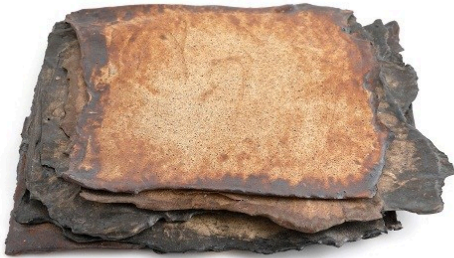
Lithified Lives 4