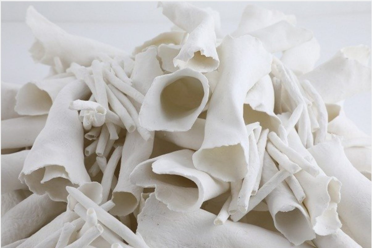
Shape-shifting Field (detail)