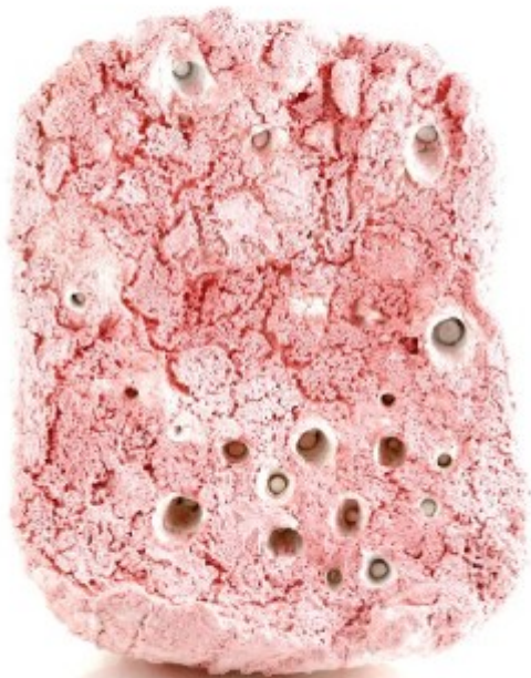
Liminal entity 1