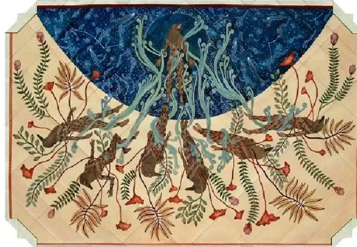
Rithika Merchant | Gouache, 2014 | 158 x 72 cms | 20 x 28 in | Gouache and Ink on Paper