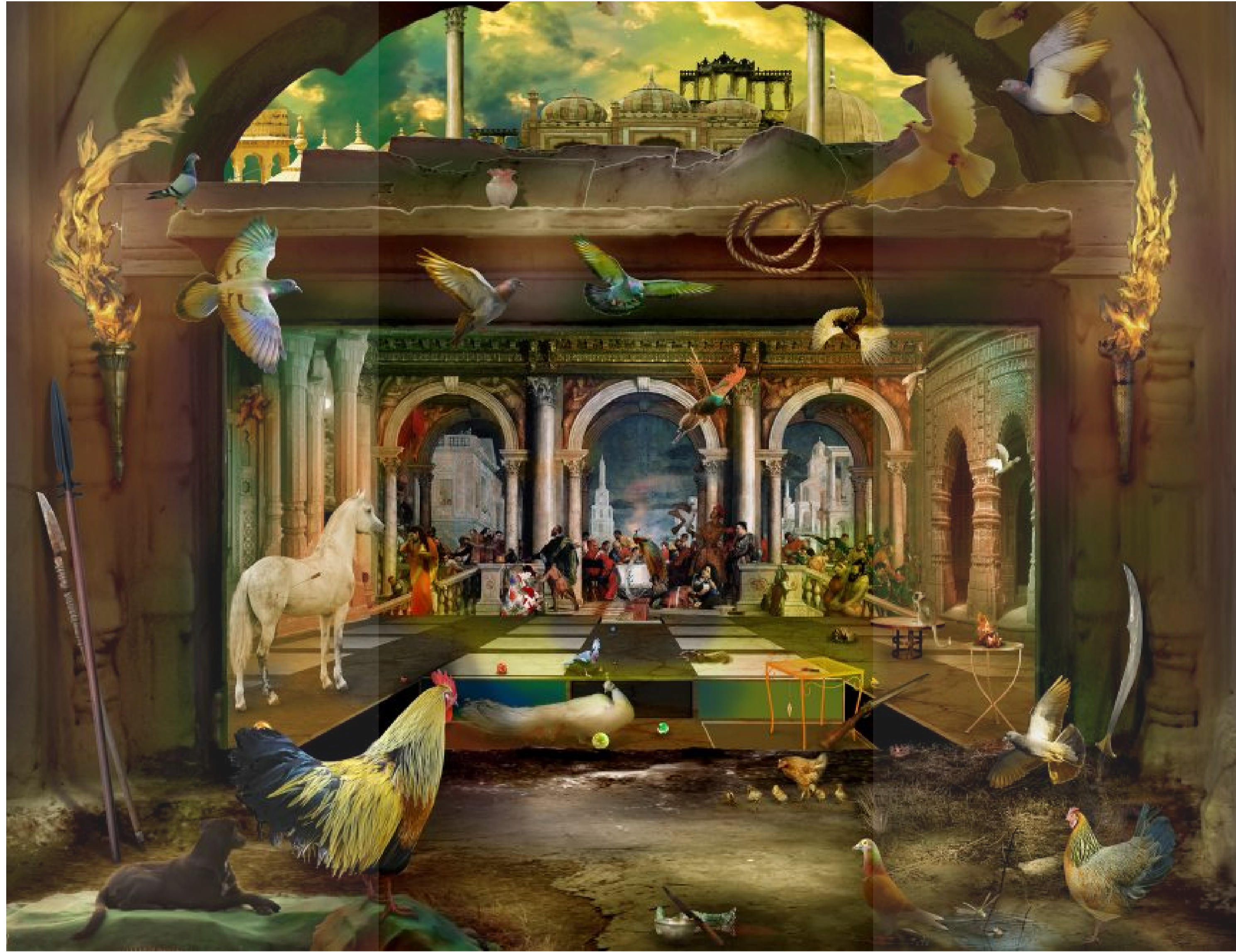
Volte gallery, Raja Ravi Verma, In the House of Levi, Mumbai Gallery Weekend