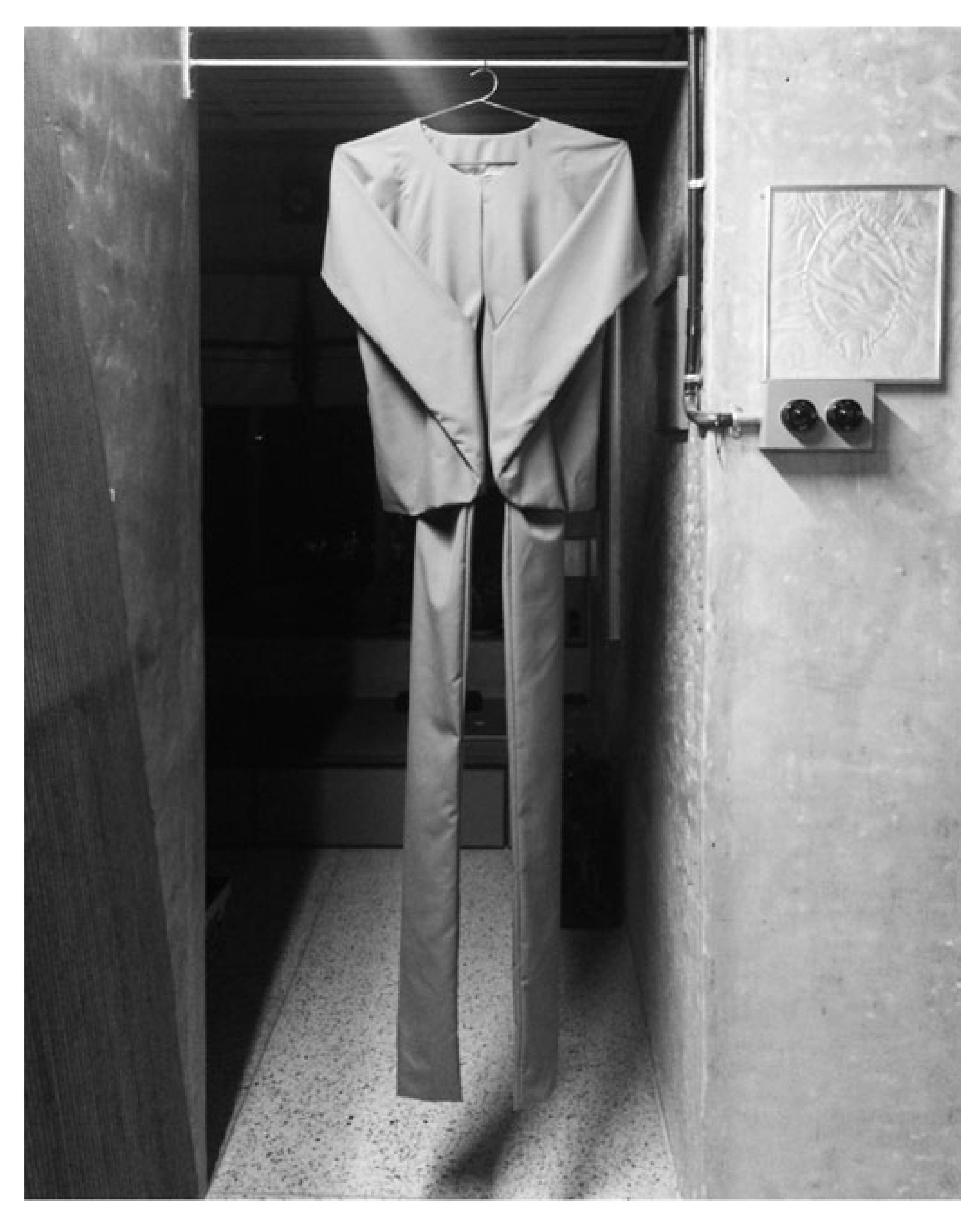
Shreyas Karle's Unnecessary Alcove is on display at Project 88