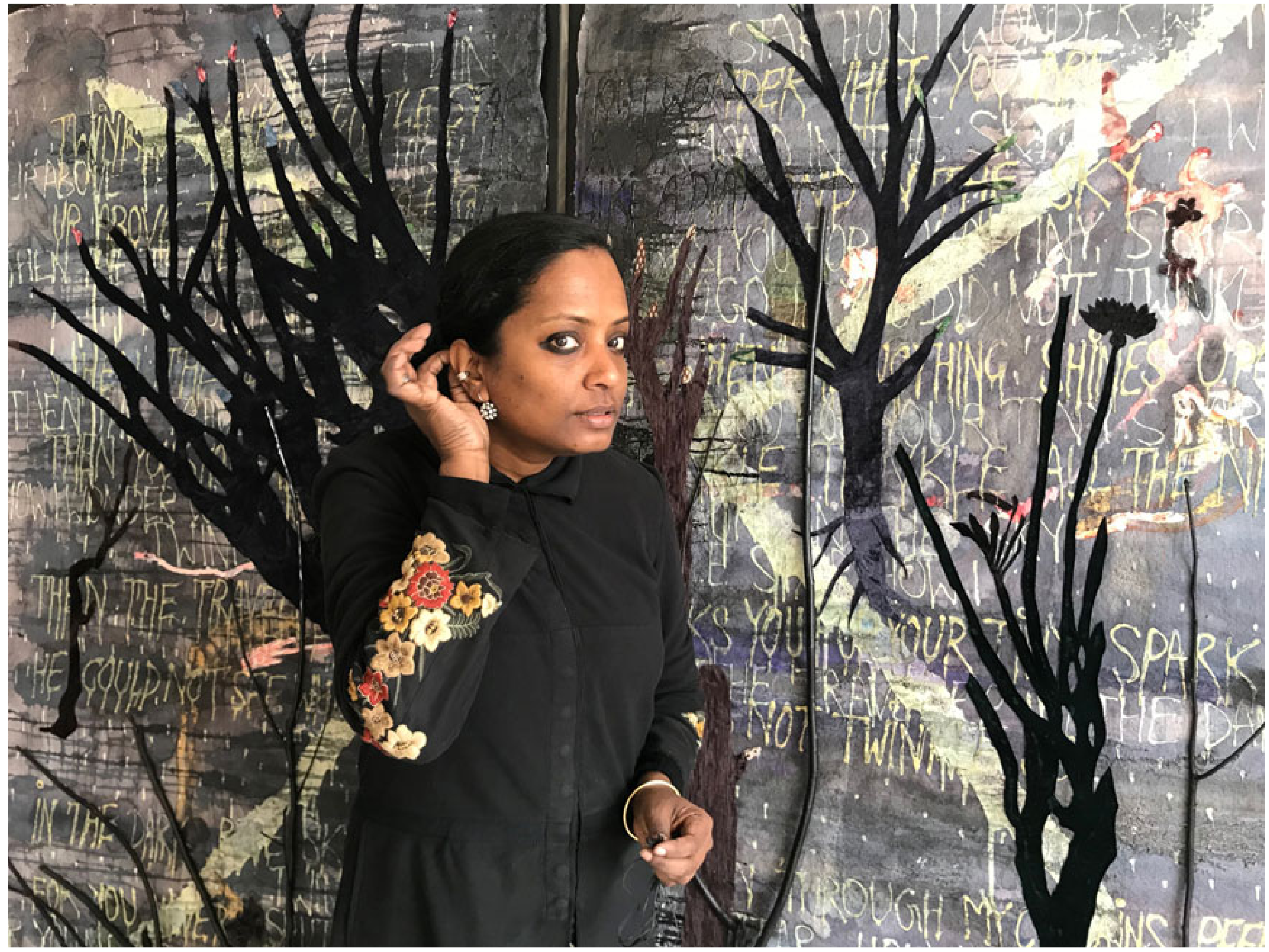
Mithu Sen's UnMythU will showcase at Chemould Prescott Road