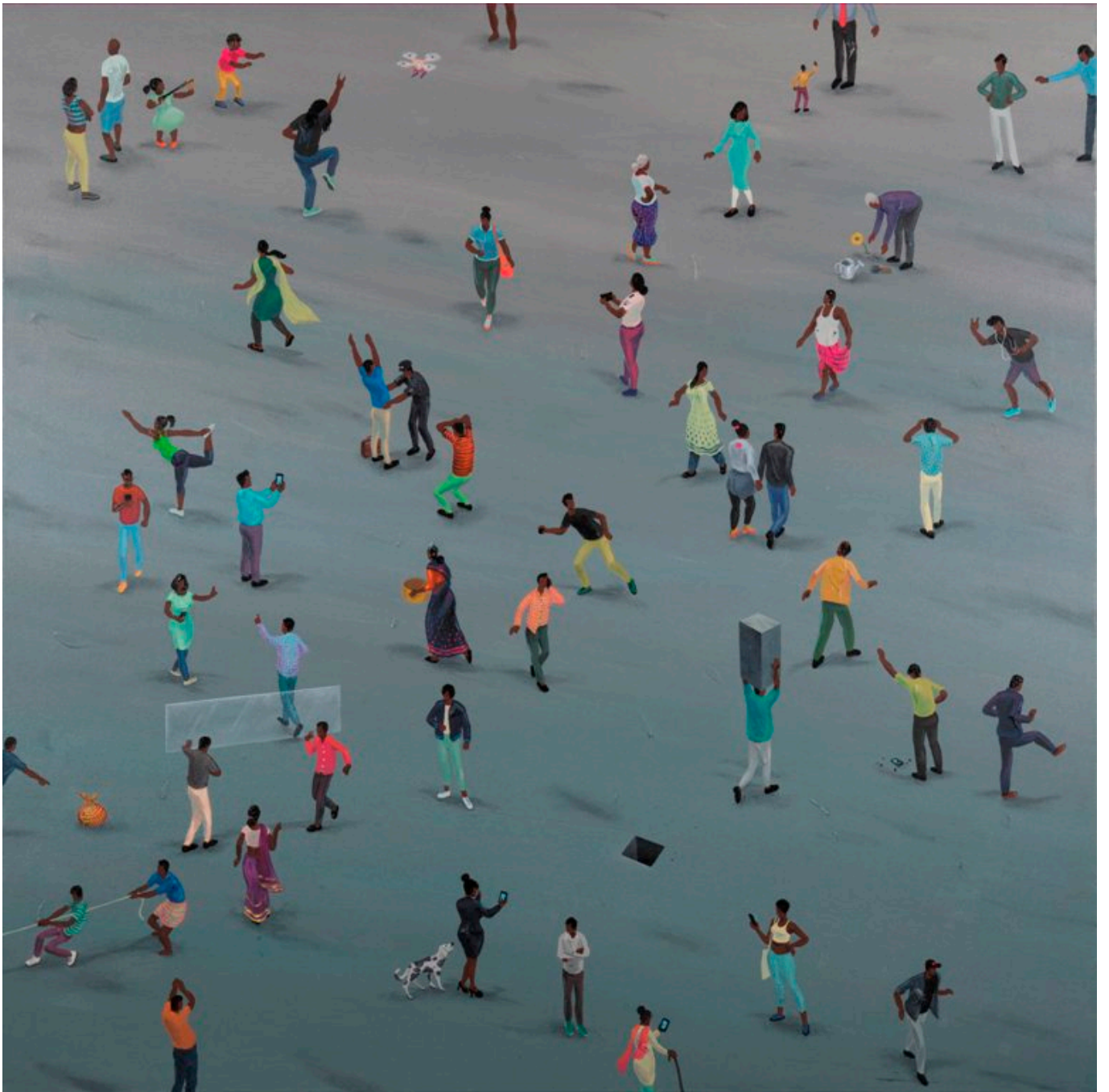
Artworks from 'A Man of the Crowd'