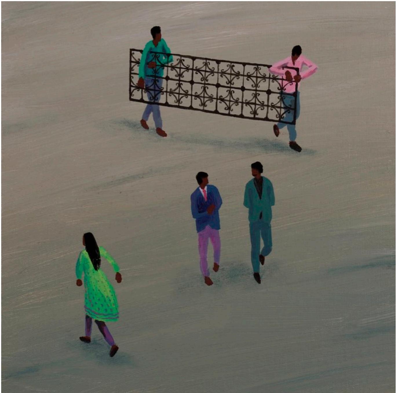
A few more artworks (acrylic on canvas) from the upcoming exhibition