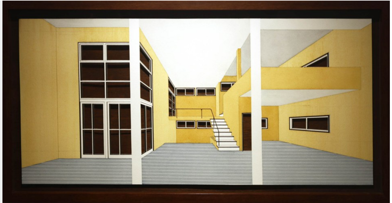
Tsuchiura [Kameura House]

Her watercolours and drawings compel viewers to see the extraordinary in ordinary objects and overlooked spaces