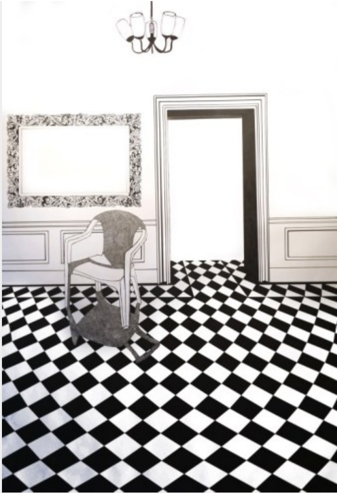
Corridor Series #1