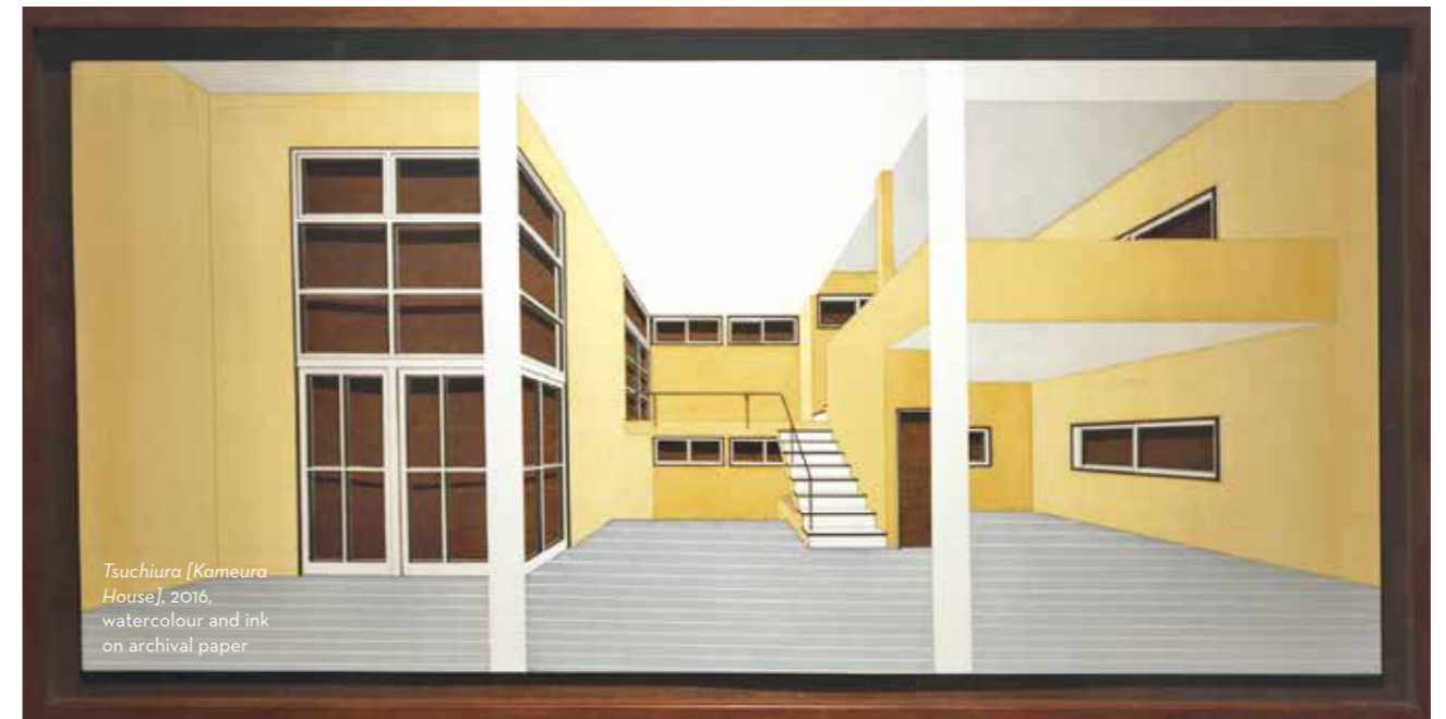
Tsuchiura [Kameura House], 2016, watercolour and ink on archival paper

Through her watercolours and drawings, Vishwa Shroff compels viewers to see the extraordinary in ordinary objects and overlooked spaces