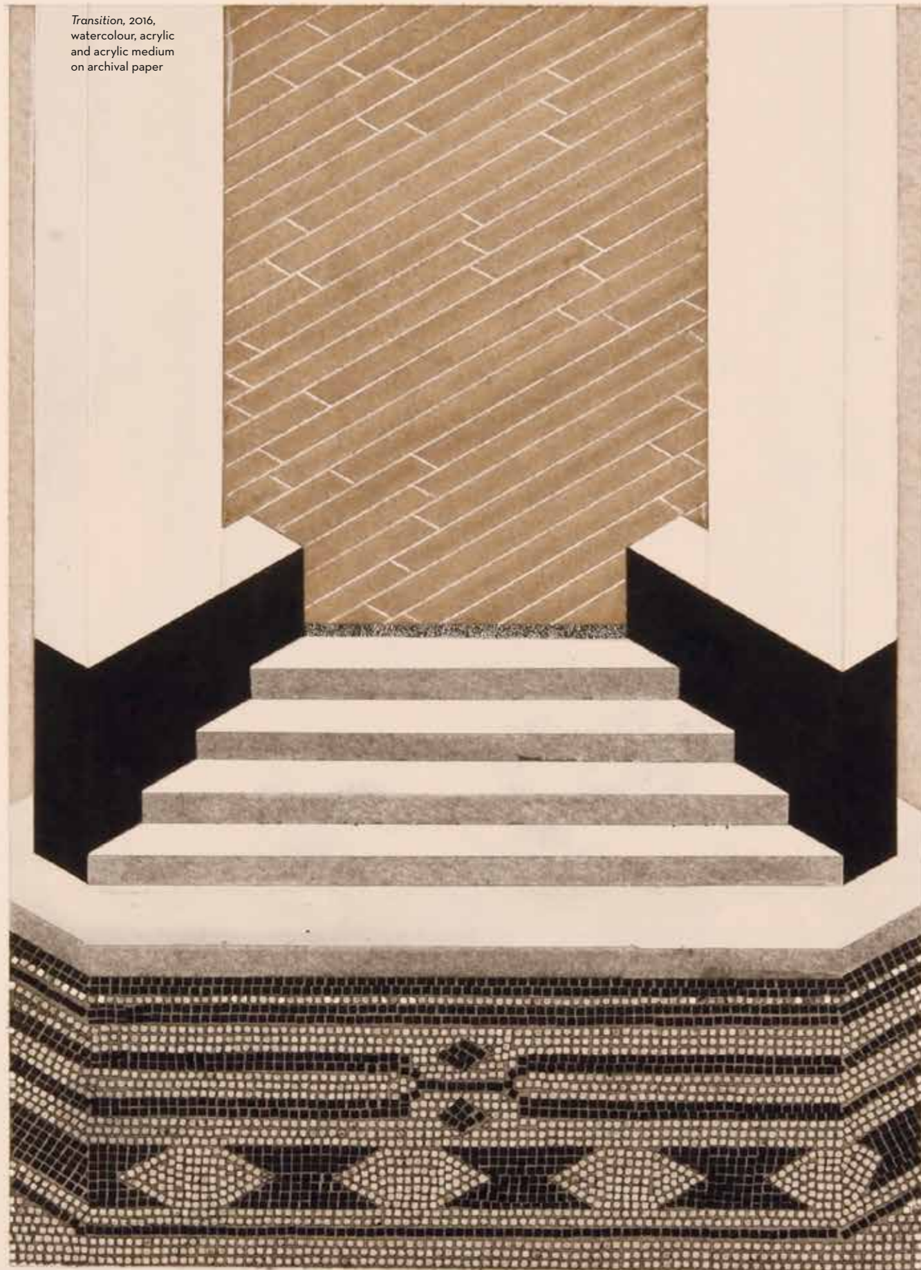
Transition, 2016, watercolour, acrylic and acrylic medium on archival paper